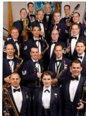
The 18-piece military concert big band, The Airmen of Note, are coming to Pensacola

tickets are required. Included with the program that each attendee will receive will be a CD of a recent Airmen of Note