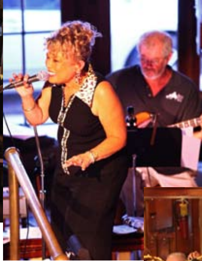
Above: The Eastside Westside Big Band put on a great show for the September Jazz Gumbo.