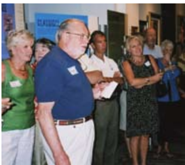
Reception attendees enjoy the informative presentation and masterful playing of the jazz trio.