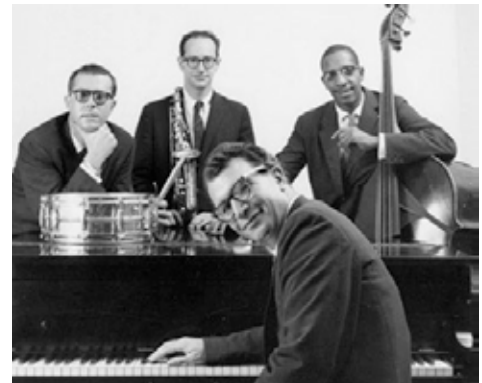
Dave Brubeck (seated at piano) with Joe Morello (drums), Paul Desmond (saxophone) and Joe Benjamin (bass).

The exhibit, sponsored by Brubeck’s alma mater College of the Pacific, is presented by West Florida Historic